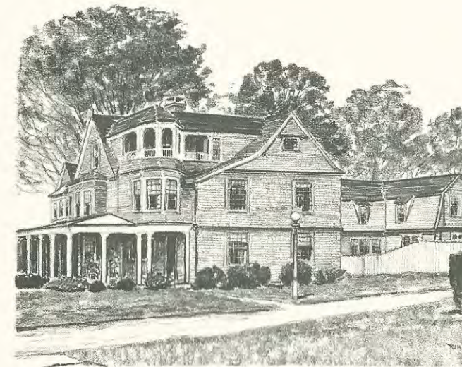
Theodore Van Itallie Cottage

*Not within proposed Historic District. Owned by the Federal Government.